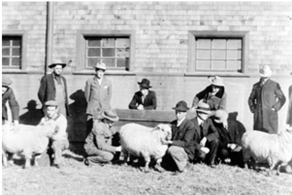
Judging Sheep - About 1907

UC Davis continues its tradition of livestock evaluation.