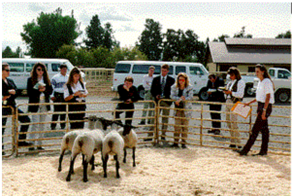
Judging Sheep - 1997