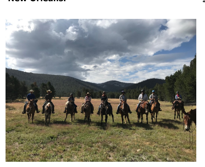
- 2018 UCD Pack Trip crew -