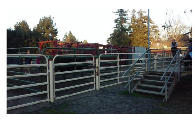
- Cattle handling demo at Cole -