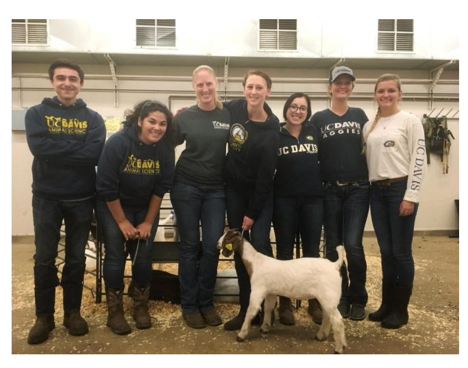
- ANS students at the 2018 Aggie Classic Sale -