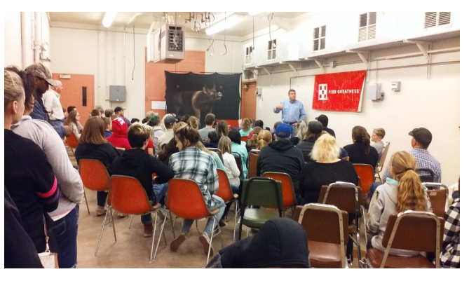
- 4-H and FFA students at the fitting and showing clinic -